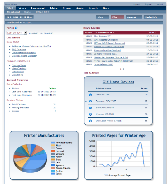
JetAdvice Manager Dashboard View